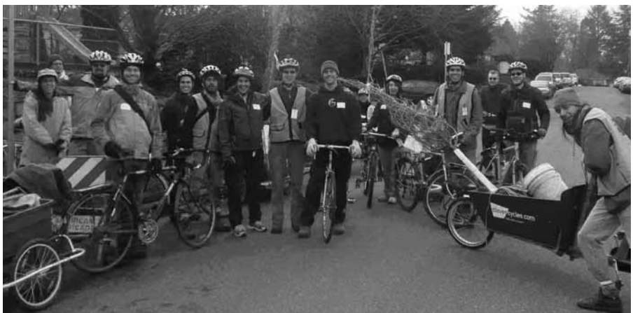
Volunteers from the Mt. Tabor, Montavilla, and North Tabor neighborhoods joined forces with Friends of Trees to plant 180 trees on March 21. Two crews rode bikes from site to site carrying trees, tools, and mulch. Imagine a tree floating down the street, strapped to a trailer pulled by a bike! The next tree planting event will be March 2010, so start thinking about your trees today. —Amy Chomowicz

The Centennial weekend will take on the flavor of an old fashioned ice cream social with cold confections provided by the Hawthorne Boulevard Ben and Jerry's store. Kids and adults alike can work off the creamy calories on the Park and Recreation Department's climbing