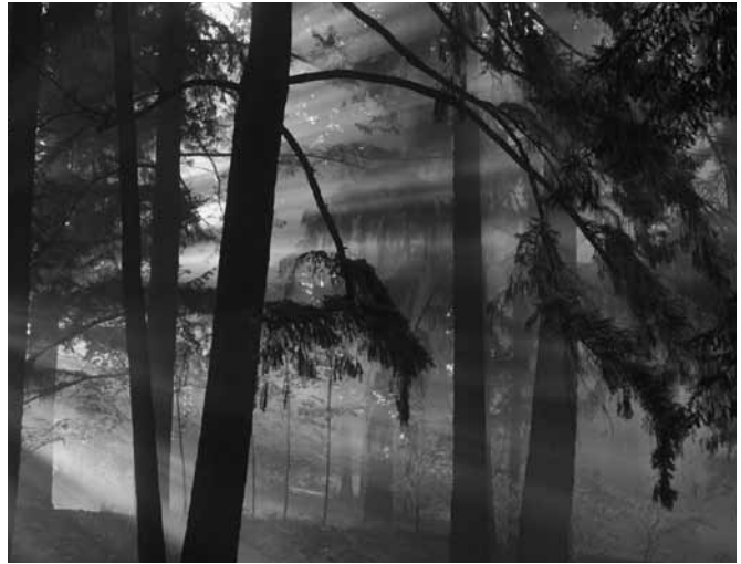
Mt. Tabor park